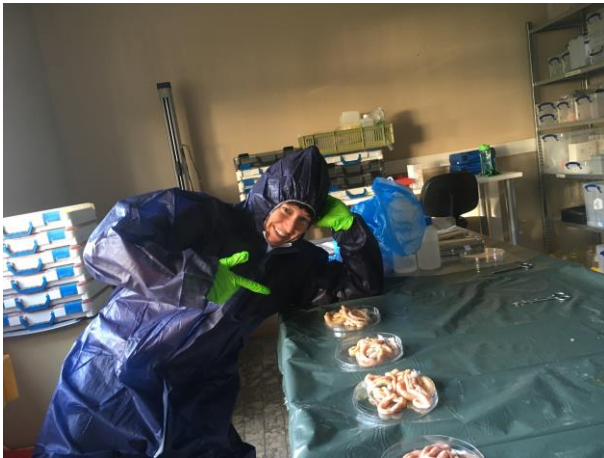
Search for worms in the guts sampled from laying hens during autopsy

Bioforum facilitates two PPILOW National Practitioner Groups, one on layers and one on pigs. Both NPGs focus on organic production. The layer NPG, consisting of laying hen farmers, veterinarians, feed producers, breeders and retailers, expressed the need to work together on the topic of natural feed additives to promote health and robustness in layers and more specifically to suppress worm infections. During a NPG meeting in 2020, scientists were invited to discuss this topic and a first idea for a research project was launched. Last months, several NPG members, Bioforum and ILVO started a two-year project to investigate the role of several plant-based products. In this project, two plant-based products will be supplied to organic layers and worm infection pressure will be monitored by means of egg counts, autopsies and blood samples. Progress and results of this project are shared on regular basis with the NPG.