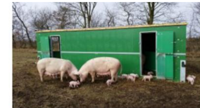
Fig. 1 and 2 – Farrowing huts from the Danish PPILOW partner firm Vanggård Staldmontage